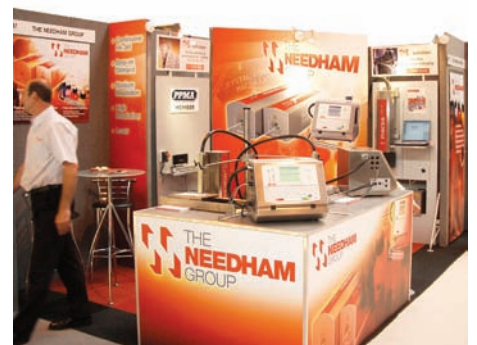
The Needham Group stand at the PPMA Show 2005, held at the NEC, proved a great success

The contract is for the supply of up to 1000 CIJ Printers and consumables over a period of 3 to 4 years.